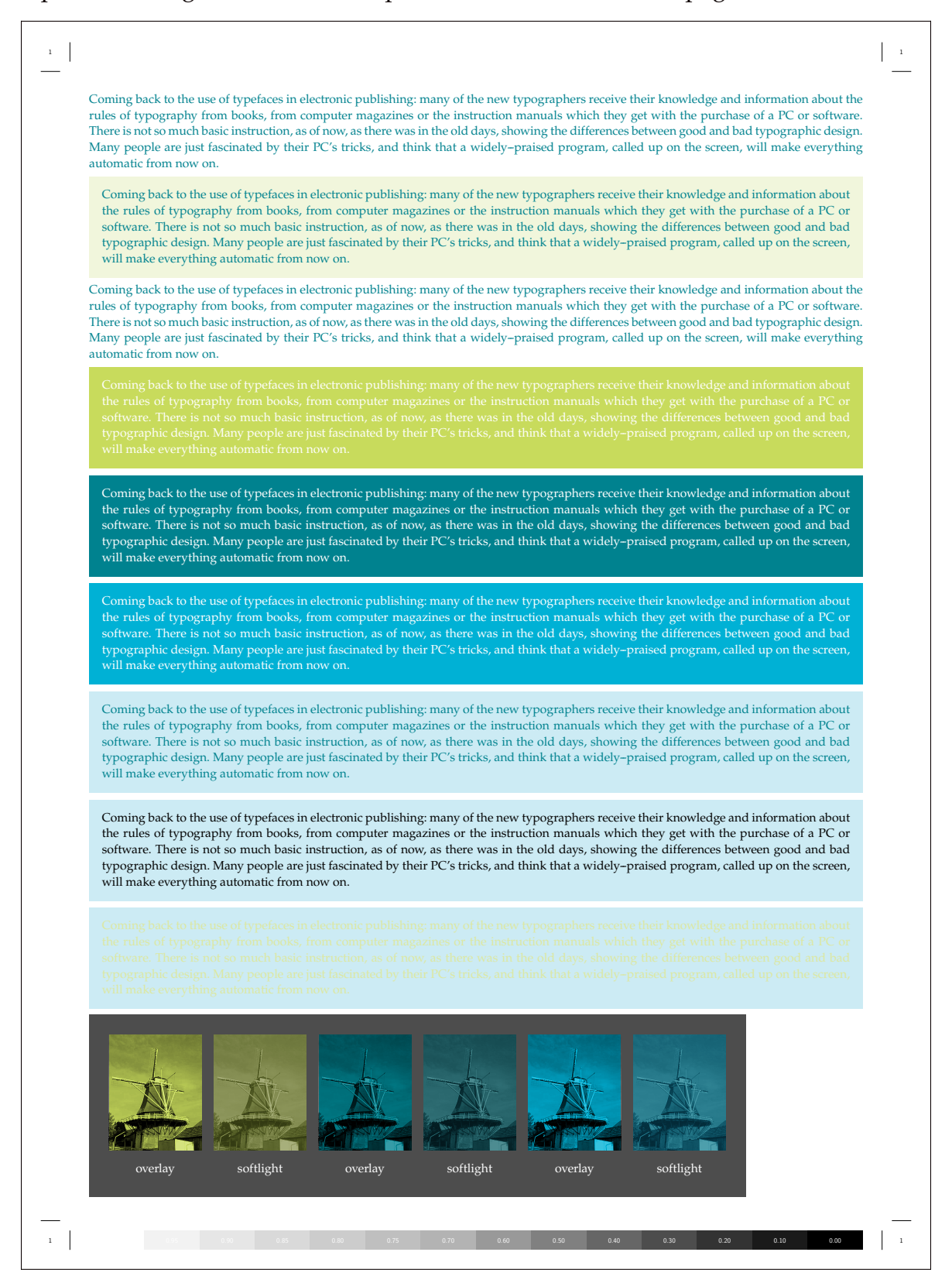
Figure 2 A test document with three spot colors & black.

This example was part of a test document with three spot colors and black, which demands four splits. The original and its four splits are shown on the next pages.